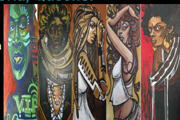
Exhibit closes Sept. 6th !

Nursha Project™ is proud to present Brooklyn born Artist Crystal Clarity with a gallery showing within the ultra chic Fatty's Cafe located in Astoria Queens.